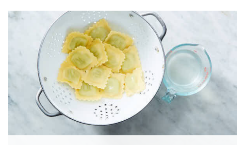
3. Cook ravioli

Melt 2 tablespoons butter in a medium skillet over medium-high heat. Add mushrooms and season with salt and pepper ; cook, stirring occasionally, until browned and dry (water will release from mushrooms then evaporate while cooking), 4-5 minutes.