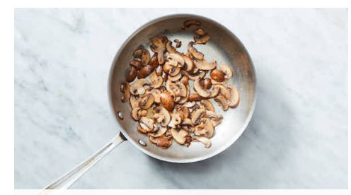
2. Sauté mushrooms

Finely grate all of the Parmesan , if necessary.