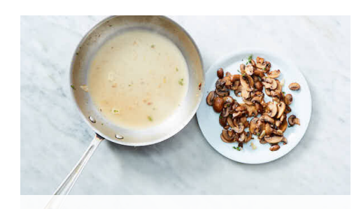
4. Start sauce

Reserve 1 cup cooking water . Drain ravioli; set aside in colander until step 5.