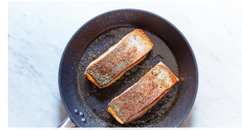
5. Cook salmon

Scrub carrots , then cut about 1½ cups into ½-inch pieces. Fill a medium pot with salted water . Bring to a boil; add carrots. Cover and simmer until just tender, 5-7 minutes. Drain carrots well, then transfer to bowl with dressing and toss to combine.