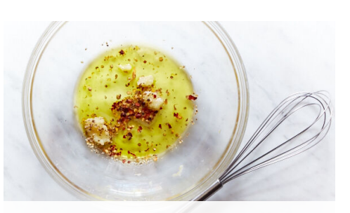
3. Make dressing

Spread pistachios out on a rimmed baking sheet. Toast on center oven rack until golden and fragrant, 6-8 minutes (watch closely as ovens vary). Let cool, then coarsely chop. Meanwhile, transfer 1/2 teaspoon coriander seeds to a medium nonstick skillet. Toast over medium heat, swirling occasionally, until fragrant, about 1 minute. Let cool, then coarsely chop. Reserve skillet for step 5.