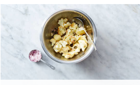
2. Make vinaigrette

Preheat oven to 450°F with a rack in the upper third. Halve cauliflower ; cut half into 1-inch florets (save rest for own use). On a rimmed baking sheet, toss cauliflower with 1 tablespoon oil and a pinch each of salt and pepper . Roast on upper oven rack until tender and browned in spots, 13-15 minutes. Carefully toss on baking sheet with capers and roast, about 3 minutes more.