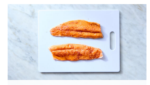
4. Season trout

Roast on upper oven rack until vegetables are just tender and browned in spots, about 15 minutes.