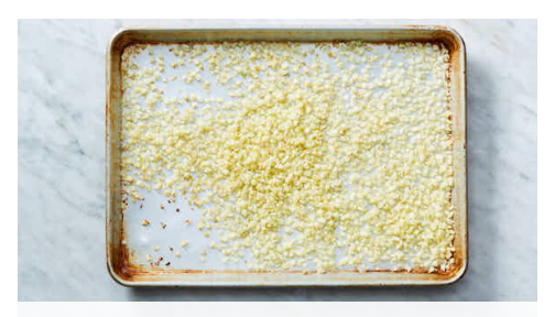
2. Broil cauliflower rice

Finely chop 1 teaspoon garlic. Pick and finely chop 2 teaspoons tarragon leaves; discard stems. Finely grate all of the lemon zest, then squeeze 2 tablespoons lemon juice into a small bowl, keeping them separate. Cut any remaining lemon into wedges. Thinly slice radishes. Trim snap peas.