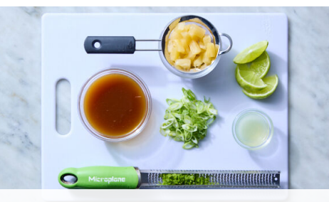
2. Prep ingredients

In a small saucepan, whisk to combine coconut milk powder, 1¼ cups hot tap water, and ½ teaspoon each of sugar and salt. Add rice and bring to a boil. Cover and cook over low heat until rice is tender and liquid is absorbed, about 17 minutes. Keep covered until ready to serve.