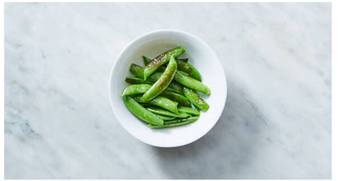
4. Cook snap peas

To small bowl with lemon juice , whisk to combine Dijon , chopped tarragon , 2 tablespoons oil , and a pinch of sugar . Season to taste with salt and pepper .