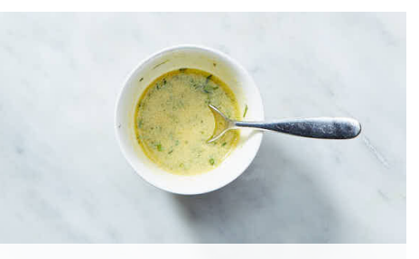
3. Make tarragon vinaigrette

Preheat broiler with a rack in the upper third. On a rimmed baking sheet, toss cauliflower rice with 2 tablespoons oil and a pinch each of salt and pepper . Spread out in an even layer. Broil on top oven rack until lightly browned and tender, stirring halfway through, about 10 minutes (watch closely as broilers vary).