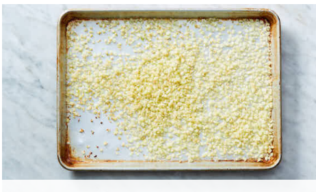
2. Broil cauliflower rice

Finely chop 1 teaspoon garlic . Pick and finely chop 2 teaspoons tarragon leaves ; discard stems. Finely grate all of the lemon zest , then squeeze 2 tablespoons lemon juice into a small bowl, keeping them separate. Cut any remaining lemon into wedges. Thinly slice radishes . Trim snap peas . Pat salmon dry and season all over with salt and pepper .