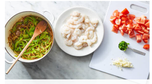
3. Cook veggies

Meanwhile, in a liquid measuring cup, stir to combine all of the coconut milk powder, ¼ teaspoon sugar , and ½ cup warm tap water . Halve bell pepper , discard stem and seeds, and thinly slice. Halve onion , then thinly slice one half (save rest for own use).