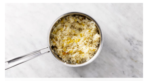
2. Make green chile rice

Halve pepper , discard stem and seeds, then slice into ½-inch pieces. Halve onion through the root end and slice into ½-inch pieces; finely chop half of the onion slices.