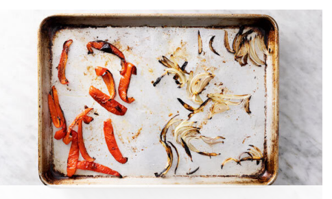
3. Broil veggies

Heat 2 teaspoons oil in a small saucepan over medium-high. Add finely chopped onion and a pinch of salt ; cook, stirring, until softened, 3-4 minutes. Add rice ; cook, stirring, until rice is toasted, 1-2 minutes. Add chopped green chiles and 1 cup water ; bring to a simmer. Cover, reduce heat to low, and simmer until liquid is absorbed, about 17 minutes. Keep covered.