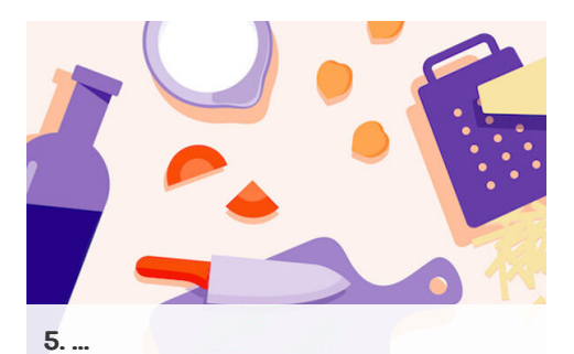
What were you expecting, more steps?

Serve baked tilapia and summer veggies with lime wedges alongside for squeezing over top. Enjoy!