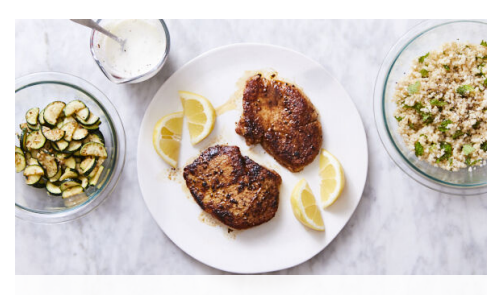
6. Season yogurt & serve

Crumble feta into a medium bowl, then add mint , bulgur , lemon zest , remaining lemon juice , and 2 teaspoons oil ; stir to combine. Season to taste with salt and pepper .