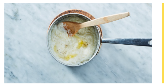
4. Finish grits

Meanwhile, in a small saucepan, bring 2 cups water and ½ teaspoon salt to a boil. Stir in grits . Reduce heat to low and cook, stirring occasionally to prevent sticking, until grains are tender, about 7 minutes.