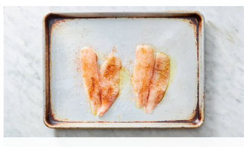
3. Prep fish

Finely chop onion . Finely chop 1 teaspoon garlic . Cut broccoli into 1-inch florets, if necessary. Finely chop chives .