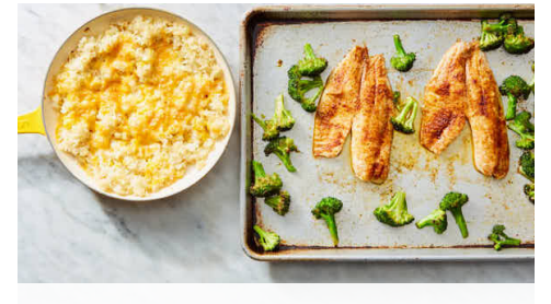
6. Broil cheese & serve

Meanwhile, heat 1 tablespoon oil in a medium ovenproof skillet over mediumhigh. Add chopped onions and garlic ; cook, stirring, until onions are golden and softened, about 5 minutes. Add sour cream, 1 teaspoon Dijon mustard , and 1/4 cup water ; stir to combine. Add rice ; cook, stirring, until warmed through, 2-3 minutes. Season to taste with salt and pepper .