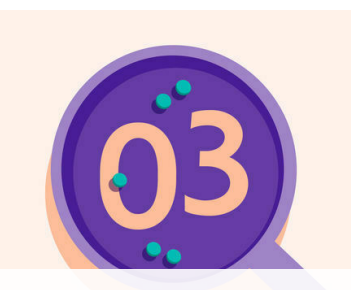
3. Cook orzo

Heat 1 tablespoon oil in a small saucepan over medium-high. Add orzo ; cook, stirring, until deep golden-brown and toasted, 3–5 minutes.