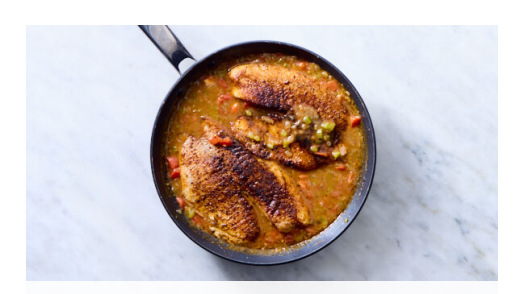
6. Simmer fish: serve

Add tomatoes to skillet; cook, stirring frequently, until starting to break down, 2-3 minutes. Add % cup water and 1 teaspoon remaining hondashi . Bring to a boil, then simmer over medium-low heat until sauce is slightly thickened, about 5 minutes. Season sauce to taste with salt and pepper .