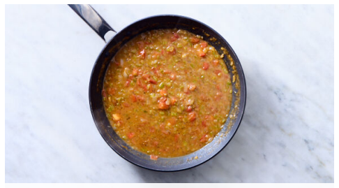
5. Simmer sauce

Reduce skillet heat to medium; add 2 tablespoons each of butter and flour. Cook, stirring constantly, until flour is the color of milk chocolate. 3-5 minutes. Add mirepoix, scallion whites, and a pinch of salt. Cook, stirring occasionally, until softened and starting to brown, 4-5 minutes. Stir in reserved Cajun seasoning and cook until fragrant, about 30 seconds.