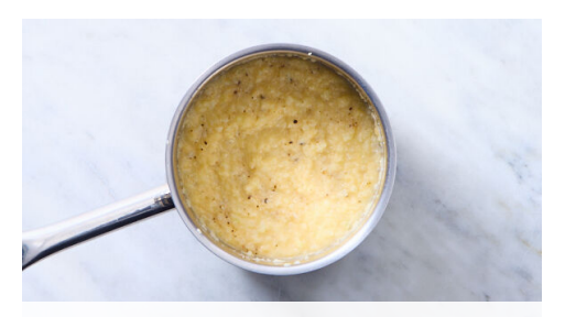
2. Cook cauliflower grits

Cut tomato into ¼-inch pieces. Trim scallions ; thinly slice, keeping dark greens separate.