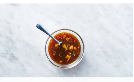
3. Make orange sauce

Meanwhile, peel and finely chop half of the ginger . Peel and finely chop 1 teaspoon garlic . Trim ends from green beans , then cut into 1-inch pieces. Pat shrimp dry, then season all over with salt and pepper ; toss with 2 tablespoons flour . Squeeze 3-4 tablespoons orange juice into a small bowl.