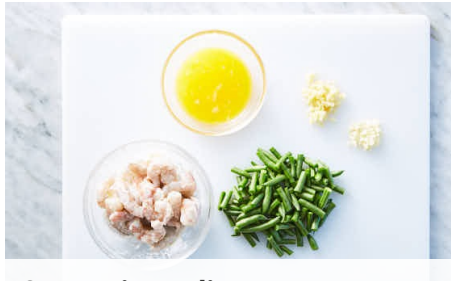
2. Prep ingredients

In a small saucepan, combine rice , 1 <sup>1</sup>/<sub>4</sub> cups water , and <sup>1</sup>/<sub>2</sub> teaspoon salt Bring to a boil over high heat, then cover and cook over low until rice is tender and water is absorbed, about 17 minutes. Remove from heat and keep covered until ready to serve.