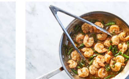
5. Stir-fry shrimp & sauce

Add all of the tamari and apricot preserves and 2 tablespoons water to orange juice , stirring to combine. Set aside until step 5.