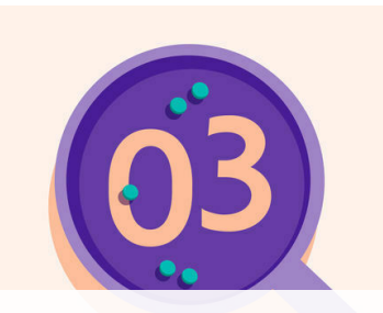
3. Cook orzo

Heat 1 tablespoon oil in a small saucepan over medium-high. Add orzo ; cook, stirring, until deep golden-brown and toasted, 3–5 minutes.