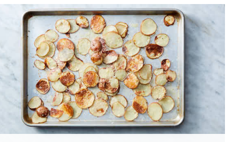
3. Roast potatoes

Scrub potatoes , then thinly slice into rounds. Place 2 tablespoons butter in a small bowl and set aside to soften at room temperature until step 6. Finely grate Parmesan .