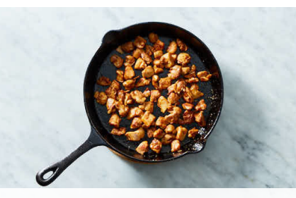
4. Cook chicken

Cut tomato into ¼-inch pieces. Finely chop half of the cilantro leaves and stems ; reserve remaining for step 6. Squeeze 2 teaspoons lime juice into a medium bowl. Cut any remaining lime into wedges. Add tomatoes, chopped cilantro, finely chopped onions , and 1 tablespoon oil to bowl with lime juice; toss to combine. Season to taste with salt and pepper .