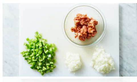
1. Prep ingredients

Calories 600kcal, Fat 40g, Carbs 23g, Proteins 40g