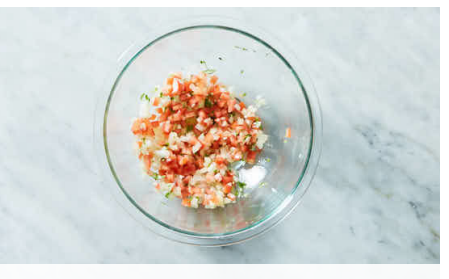
3. Make pico de gallo

Heat 1 tablespoon oil in a medium ovenproof skillet over medium-high. Add peppers and ½-inch onion pieces ; season with salt and pepper . Cook, stirring, until peppers are softened, 5-6 minutes (if skillet is dry, add 1 tablespoon water at a time, as needed). Transfer to a bowl and cover to keep warm. Reserve skillet for step 4.