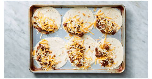
5. Assemble quesadillas

Add glaze to skillet with beef ; cook, scraping up browned bits from bottom skillet, until glaze coats beef and skillet is mostly dry, 1-2 minutes. Season to taste with salt and pepper .