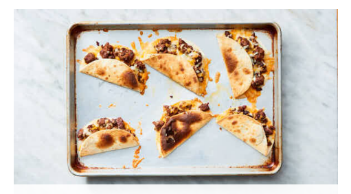
6. Broil quesadillas & serve

Brush one side of each tortilla generously with neutral oil . Arrange tortillas on a rimmed baking sheet, oiled side down. Divide beef mixture among tortillas, spooning filling onto 1 half of each tortilla, then top with shredded cheddar-jack cheese . Fold in half to close.