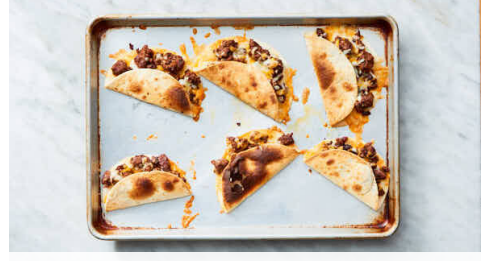
5. Broil quesadillas

Brush one side of each tortilla generously with neutral oil . Arrange tortillas on a rimmed baking sheet, oiled side down. Divide beef mixture among tortillas, spooning filling onto 1 half of each tortilla, then top with shredded cheddar-jack cheese . Fold in half to close.