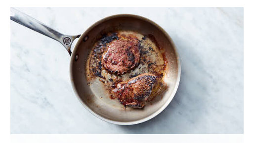
5. Cook steaks

Meanwhile, bring a medium saucepan of salted water to a boil. Trim green beans. Pick 1 teaspoon thyme leaves from stems, then finely chop; discard stems. Add green beans to boiling water; cook until crisp-tender, 3-4 minutes. Drain well, then return to saucepan and drizzle with oil. Cover to keep warm until ready to serve.