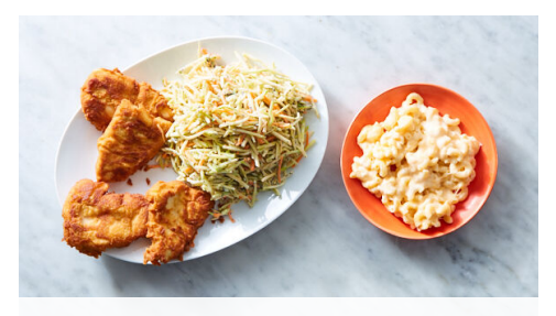
6. Finish & serve

Heat 1/4-inch oil in reserved skillet over medium-high until shimmering (oil should sizzle vigorously when a pinch of flour is added). Add chicken and cook until golden and crisp all over, and chicken is cooked through, 3-5 minutes per side (reduce heat if browning too quickly). Transfer to a paper towel-lined plate; season lightly with salt .