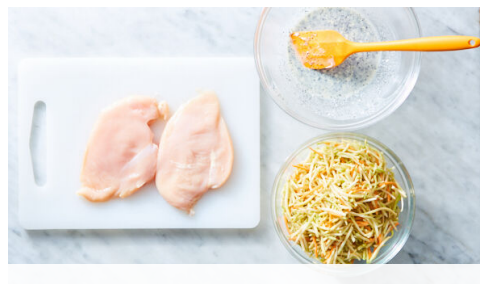
3. Pound chicken

Transfer poppy seeds to a large heavy skillet (preferably cast-iron) and toast over medium heat, stirring occasionally, until fragrant and lightly browned, 2-3 minutes. Transfer to a medium bowl; whisk in mayonnaise , remaining cream cheese , 1 tablespoon each of buttermilk powder and water, 1½ tablespoons sugar, 2 teaspoons vinegar, and ½ teaspoon salt Reserve skillet for step 5.