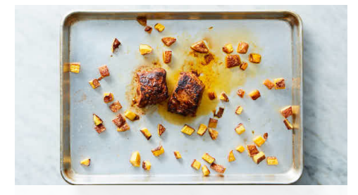
4. Sear & roast pork

On a rimmed baking sheet, toss potatoes with 1 tablespoon oil and a generous pinch of each salt and pepper . Roast on upper oven rack until poatoes are tender and lightly browned, about 12 minutes. Remove from oven and use a spatula to flip potatoes.