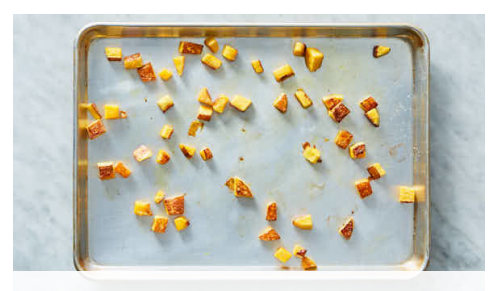
3. Roast potatoes

Finely chop 2 teaspoons each of peeled ginger and garlic. Finely chop 1 tablespoon jalapeño (or more, or less depending on heat preference). Remove kale leaves from tough stems; discard stems. Cut leaves into 1-inch wide ribbons. Scrub and peel sweet potato, then cut into 1-inch pieces.