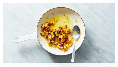
6. Glaze potatoes & serve

Heat 1 tablespoon oil and 1 teaspoon of the chopped garlic in same skillet over medium-high until fragrant, about 1 minute. Add kale leaves in handfuls, stirring after each addition, until tender, 3-5 minutes. Season to taste with salt and pepper. Transfer to a bowl and cover to keep warm. Wipe out skillet.