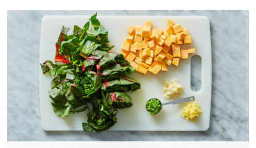
2. Prep ingredients

Preheat oven to 450°F with a rack in the upper third. In a medium bowl, combine 1 tablespoon oil, 2¼ teaspoons berbere spice, and a generous pinch of salt. Pat pork dry, then add to marinade, rubbing all over to coat. Set aside until step 4.