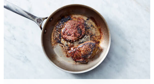
5. Cook steaks

Meanwhile, bring a medium saucepan of salted water to a boil. Trim green beans. Pick 1 teaspoon thyme leaves from stems, then finely chop; discard stems. Add green beans to boiling water; cook until crisp-tender, 3-4 minutes. Drain well, then return to saucepan and drizzle with oil. Cover to keep warm until ready to serve.