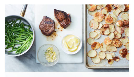
6. Finish & serve

Remove steaks from marinade; discard marinade. Pat steaks dry and season all over with salt and pepper . Heat 2 teaspoons oil in a medium heavy skillet (preferably cast-iron) over medium-heat. Add steaks and cook until deeply browned and medium-rare, 3-4 minutes per side (or longer for desired doneness). Transfer steaks to a cutting board and let rest for 5 minutes.