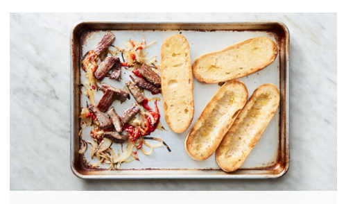
3. Broil steak

Tear reserved bread into small pieces for croutons. Toss with oil and a pinch each of salt, pepper, and Italian seasoning.