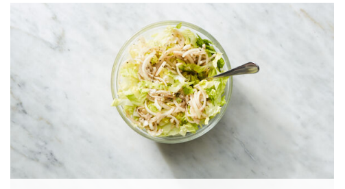
5. Finish salad

Remove sauce from heat. Whisk in shredded cheese until melted. Season to taste with salt and pepper . Cover to keep warm.