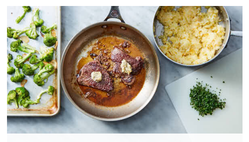
6. Mash potatoes & serve

Meanwhile, finely chop chives . Use a fork to mash softened butter and steak seasoning together until combined. Remove skillet from heat; carefully add 1/4 cup water . Spread seasoned butter over top of steaks and let steaks rest in skillet off the heat while you finish preparing the mashed potatoes .