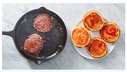
3. Toast buns

Heat 2 teaspoons oil in a medium heavy skillet (preferably cast-iron) over mediumhigh. Add patties, top with half of the sliced onions , then press with a spatula to flatten into 5-inch wide burgers. Cook, undisturbed, until browned on bottom, 3-4 minutes.