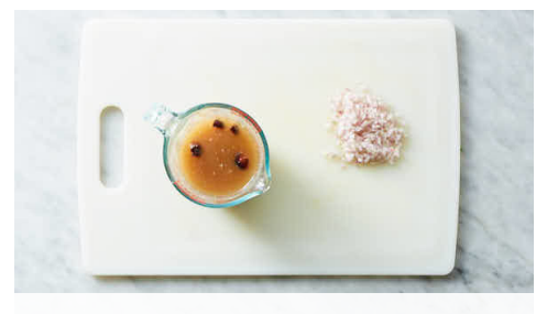
3. Prep broth mixture

Meanwhile, halve Brussels sprouts (or quarter if large); remove any outer leaves, if necessary. Scrub and trim carrot , then cut into ½-inch-thick slices on an angle. On a rimmed baking sheet, toss Brussels sprouts and carrots with 2 tablespoons oil and a generous pinch each of salt and pepper. Roast on upper oven rack until golden brown and tender, 15-20 minutes.