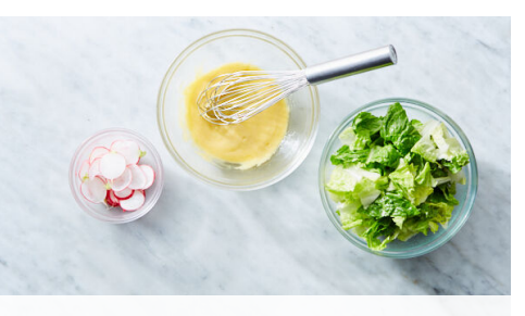
3. Prep salad

Heat 1 tablespoon oil in a medium skillet over medium-high. Add beef and season with a pinch each of salt and pepper . Cook until well browned, 5-7 minutes.