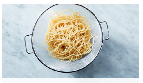
3. Cook pasta

Cut broccoli into 1-inch pieces, if necessary. Transfer to a rimmed baking sheet, and toss with 1 tablespoon oil and season with salt and pepper . Roast on center oven rack until lightly charred and crisp-tender, 10-12 minutes.