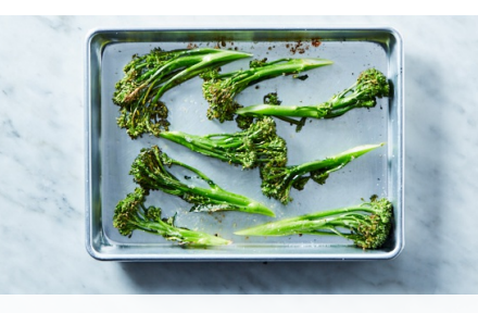
2. Roast broccoli

Preheat oven to 425°F with a rack in the center. Bring a large pot of salted water to a boil. Thinly slice 2 large garlic cloves . Finely grate <sup>1</sup>/<sub>2</sub> teaspoon lemon zest and squeeze 1 tablespoon juice into a medium bowl. Cut bacon crosswise into <sup>1</sup>/<sub>2</sub>-inch wide pieces. Finely grate all of the Parmesan . Pick sage leaves from stems, discarding stems.