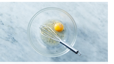
4. Prep sauce

Add spaghetti to boiling water and cook, stirring often to prevent noodles from sticking, until barely al dente, 5-7 minutes. Reserve 1 cup cooking water , then drain pasta.