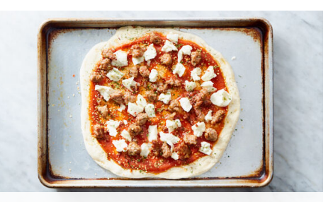
3. Assemble pizza

Generously oil a rimmed baking sheet. On a floured surface, roll or stretch pizza dough into a 12-inch circle. If dough springs back, cover and let sit 5-10 minutes to relax before rolling again. Dust off excess flour; carefully transfer to prepared baking sheet.