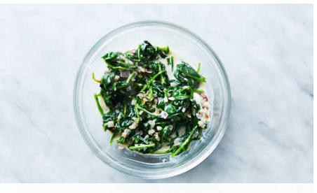
3. Cook spinach

Meanwhile, finely chop ½ cup onion. Finely chop 1 large garlic clove. Pick and finely chop ½ teaspoon thyme leaves from remaining sprigs. In a liquid measuring cup or small bowl, whisk to combine cream cheese and ¼ cup water (it's ok if it is lumpy).