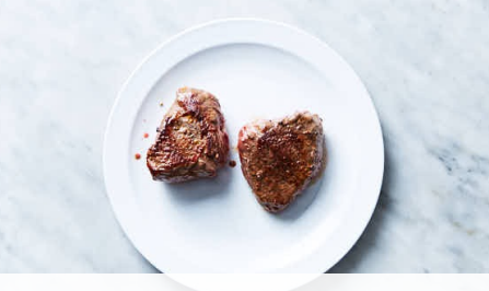
4. Cook steaks

Heat 1 tablespoon oil in a medium skillet over medium-high. Add chopped garlic and half of the onions . Cook until softened, 1-2 minutes. Add spinach in large handfuls, stirring to wilt after each addition. Add cream cheese mixture to skillet. Cook, stirring, until combined, 1-2 minutes. Season to taste with salt and pepper . Transfer to a bowl and cover to keep warm.