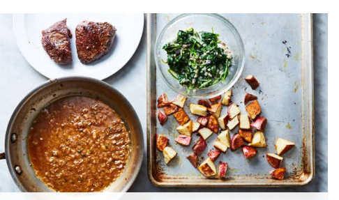
6. Slice steaks & serve

Immediately add remaining chopped onions to skillet, and cook, stirring, about 1 minute. Add chopped thyme , broth concentrate , and ½ cup water . Bring to a simmer and cook until sauce is reduced to ¼ cup, about 3 minutes. Swirl in 1 tablespoon butter . Season to taste with salt and pepper .