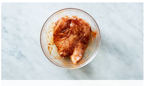
1. Marinate chicken

Calories 790kcal, Fat 41g, Carbs 54g, Protein 53g