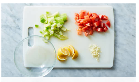
2. Prep ingredients

In a separate small bowl, stir to combine all of the sour cream, chopped garlic, 1 tablespoon water, and ½ tablespoon oil. Season to taste with salt and pepper.