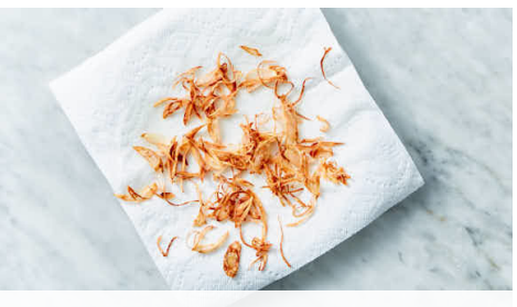
3. Fry shallots

In a medium bowl, whisk to combine mayonnaise, 2¼ teaspoons ranch seasoning, 1 tablespoon oil, 2 teaspoons vinegar, and ½ teaspoon sugar. Add sliced cabbage and grated carrots; toss to coat. Season to taste with salt and pepper.