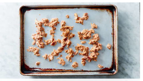
4. Broil pork

Preheat broiler to high with top rack 6 inches from heat source. Halve and thinly slice all of the shallot . Heat ½ inch oil in a medium skillet over medium until shimmering. Add shallots and cook, stirring frequently with a fork, until lightly golden, 3-5 minutes. Use a slotted spoon to transfer fried shallots to paper towels to drain and season lightly with salt .