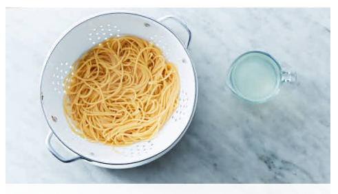
3. Cook spaghetti

While bacon cooks, trim scallions , then thinly slice about ¼ cup. Trim ends from Fresno chile , then thinly slice. Finely grate Parmesan .