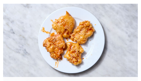
5. Fry chicken

Meanwhile, heat 1-inch oil in a large heavy skillet (preferably cast-iron) over medium-high until shimmering (oil should register 350°F; a drop of batter should sizzle immediately when added). Add chicken to remaining batter and stir to coat.