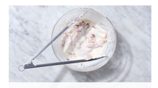
4. Batter chicken

Grease waffle iron with nonstick cooking spray. Following manufacturer instructions, cook waffles until goldenbrown, using half of the batter at a time. Keep waffles warm by placing on a wire rack in a preheated oven.