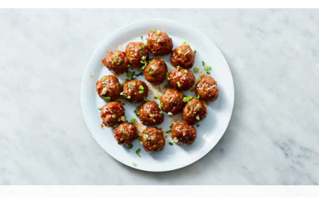
2. Cook meatballs

Preheat oven to 450°F with a rack in the center. Peel and finely chop 2 teaspoons each garlic and ginger . Trim scallions , then thinly slice. In a medium bowl, knead to combine beef , panko , chopped garlic and ginger, ¾ of the scallions, 1 teaspoon salt, 1 large egg , and a few grinds of pepper . Shape into 16 mini meatballs. Transfer to an oiled medium ovenproof skillet.