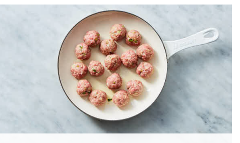
1. Prep meatballs

Calories 370kcal, Fat 19g, Carbs 33g, Protein 16g