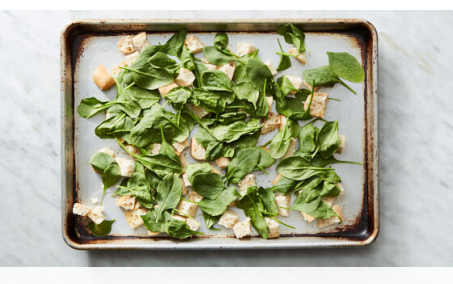
2. Wilt spinach

Preheat oven to 325°F with a rack in the center. Cut ciabatta rolls into 1-inch pieces. Transfer to a rimmed baking sheet in an even layer. Toss with 2 tablespoons oil and a pinch each of salt and pepper. Bake on center oven rack until just starting to crisp, 8-10 minutes.