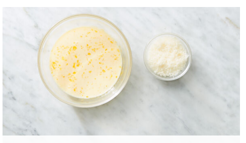
3. Prep ingredients

Scatter spinach on top of ciabatta and return to oven until just wilted, 2-3 minutes more. Allow to cool to the touch.