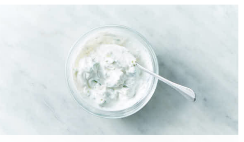
3. Make tzatziki

Add tomatoes and all but ¼ cup of the cucumbers to dressing and toss to coat. Set aside until ready to serve.