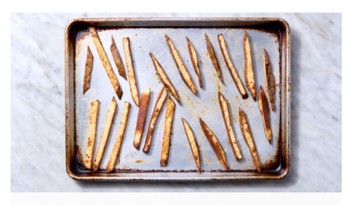
2. Bake fries

Preheat oven to 450°F with a rack in the lower third. Scrub potatoes ; cut lengthwise into ½-inch thick fries. On a rimmed baking sheet, toss potatoes with 1 tablespoon flour and 2 tablespoons oil ; season with salt and pepper .