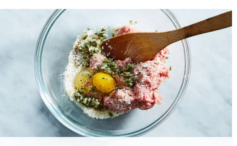
3. Make meatloaves

Finely chop ¼ cup onion. Pick half of the sage leaves from stems; finely chop, discarding stems (save remaining onion and sage for own use). Trim stem ends from green beans. Heat 1 tablespoon oil in a medium skillet over medium. Add chopped onions; cook, stirring, until softened, about 2 minutes. Stir in chopped sage; cook until fragrant, about 1 minute.