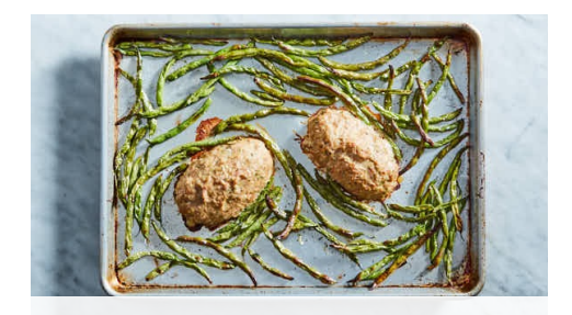
4. Roast beans & meatloaves

Transfer sautéed onions to a large bowl and allow to cool slightly (reserve skillet for step 6). To bowl with onions, add turkey, 1 packet broth concentrate (reserve remaining packet for step 6), 1 large egg, ¼ cup panko, ½ teaspoon salt , and a few grinds of pepper ; knead to combine. Form meatloaf mixture into 2 (4-inch) long oval patties.