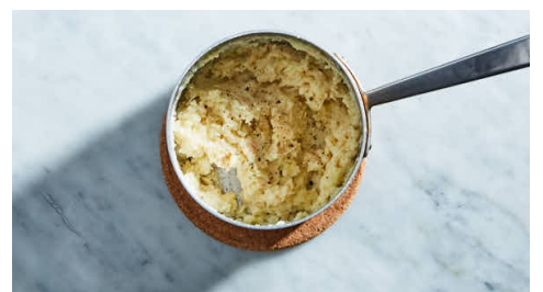
5. Mash potatoes & parsnips

On a rimmed baking sheet, toss green beans with 2 teaspoons oil and season with salt and pepper . Place meatloaves on baking sheet between green beans and roast on upper oven rack until green beans are tender and charred, and meatloaves are firm to the touch and reach 165°F internally, 15–20 minutes (watch closely as ovens vary).