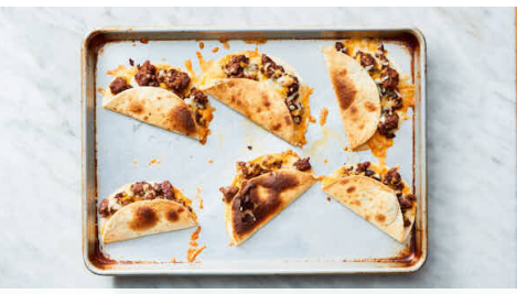
5. Broil quesadillas

Heat 1 tablespoon neutral oil in a medium skillet over high. Add beef ; cook, breaking up into smaller pieces, until cooked through and browned in spots, 4-5 minutes. Stir in remaining chopped garlic ; cook until fragrant, about 1 minute. Add glaze ; cook, scraping up browned bits from bottom of skillet, until beef is coated and skillet is mostly dry, 1-2 minutes. Season to taste.