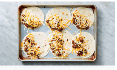
4. Assemble quesadillas

In a medium bowl, toss cucumbers with 2 teaspoons each of the chopped garlic, vinegar, and sesame seeds, 1 teaspoon each of tamari, sesame oil, and sugar, and ½ teaspoon salt. Set cucumbers aside until ready to serve.