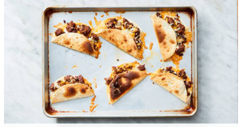
5. Broil quesadillas

Brush one side of each tortilla generously with neutral oil . Arrange tortillas on a rimmed baking sheet, oiled side down. Divide beef mixture among tortillas, spooning filling onto 1 half of each tortilla, then top with shredded cheddar-jack cheese . Fold in half to close.