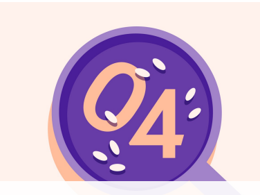
4. Toast tortillas

Heat 1 tablespoon oil in a medium skillet over medium-high. Add chopped poblano and cook until crisp-tender and browned in spots, about 5 minutes. Add garlic and cook until fragrant, about 1 minute. Add beef and ¼ teaspoon salt and cook, breaking up into pieces, until browned, about 5 minutes. Remove skillet from heat.