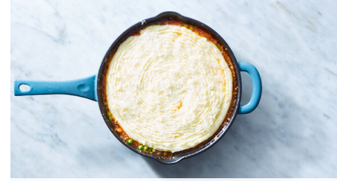
5. Finish filling & assemble

Remove skillet from heat. Stir in peas , thyme, and ½ of the remaining Parmesan; season to taste with salt and pepper.