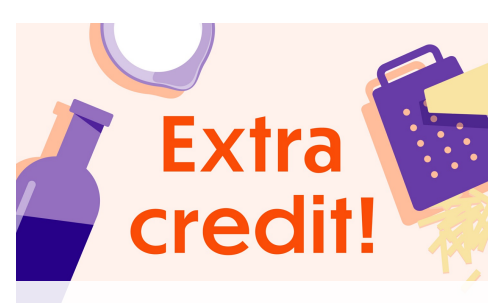
6. Take it to the next level

Return potatoes to medium heat. Add 2 tablespoons butter and 3 tablespoons reserved potato water. Mash well, and season to taste with salt and pepper. Thinly slice pork. Serve pork alongside mashed potatoes and peas, with gravy spooned over top. Enjoy!