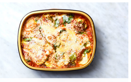
3. Bake & serve

Add half of the marinara to tray and spread into an even layer. Top with <sup>2</sup>/<sub>3</sub> of the spinach, sprinkle with half of the Parmesan, then place ravioli on top. Dollop ricotta over top, then add remaining spinach. Top with remaining marinara and spread into an even layer. Top with mozzarella and remaining Parmesan.