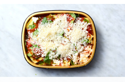
2. Assemble tray

Grate mozzarella on the large holes of a box grater. Finely grate Parmesan .