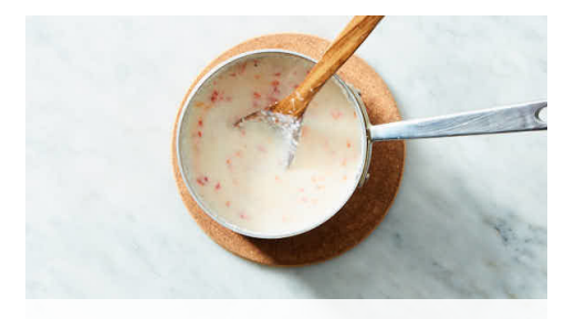
4. Add peppers & cheese

In a small saucepan, combine 2 cups water and ½ teaspoon salt; bring to a boil over high heat. Slowly stir in grits. Reduce heat to low and cook, stirring occasionally to prevent sticking, until grains are tender, about 7 minutes.