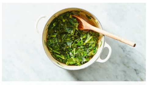
2. Braise collard greens

Finely chop 1 teaspoon garlic . Trim stem ends from collard greens , then thinly slice stems, crosswise, and cut leaves into bite-size pieces. Finely chop roasted red peppers .