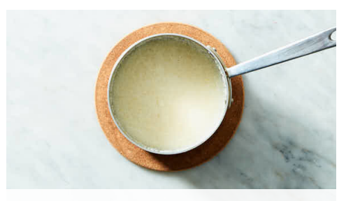
3. Cook grits

Heat 1 tablespoon oil in a medium Dutch oven or pot over medium-high. Add chopped garlic and greens to pot; cook, stirring, until fragrant, 1 minute. Add broth concentrate and 1 cup water . Bring to a simmer. Cover and cook over medium-low heat until greens are very tender, 12-15 minutes. Stir in 2 teaspoons vinegar . Season with salt and