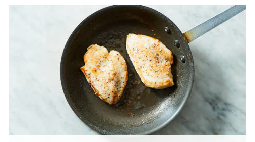
5. Brown chicken

Stir cream cheese, cheddar cheese, and roasted red peppers into grits. Season to taste with salt and pepper. Remove from heat and cover to keep warm.