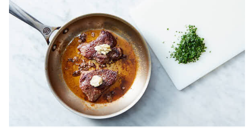
5. Finish steaks

Meanwhile, pat steaks dry and season all over with salt and pepper . Heat 1 tablespoon oil in a medium skillet over medium-high. Add steaks and cook until browned all over, 3-4 minutes per side for medium-rare (or longer for desired doneness).